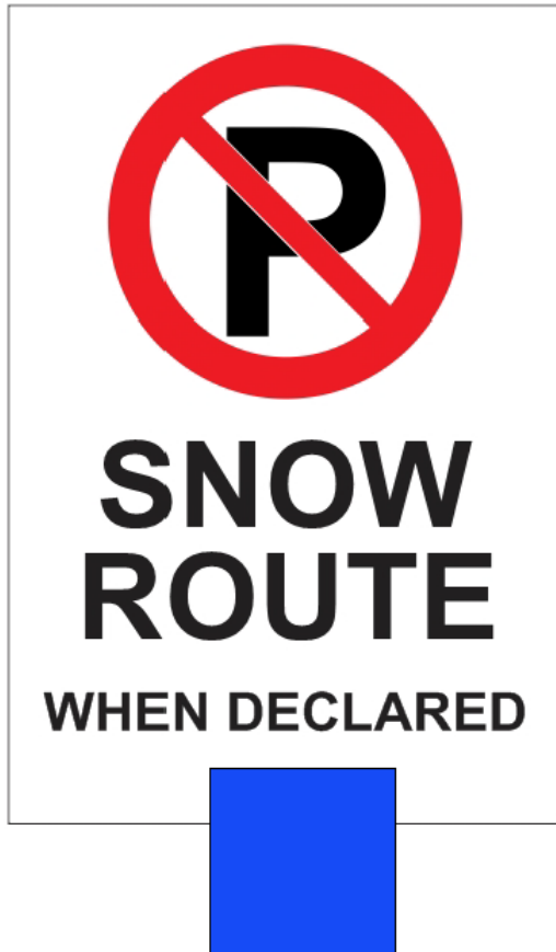
Blue Square Snow Route